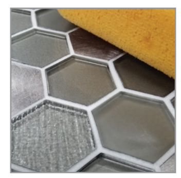
Wait at least 15-30 minutes before removing the final haze from the tile or stone surface with a slightly dampened sponge or a microfiber towel.

Important: Do not let water sit on top of grout joints as it will interfere with the final clean up and curing, thus causing poor results.