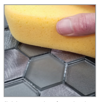
Slightly moisten tile surface with a damp sponge just before application to help with spreading the grout.