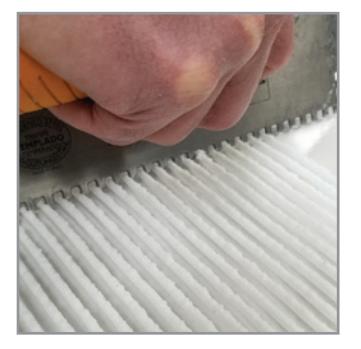
Apply an adhesive layer using the notched side of the trowel ridge in a straight-line directional pattern to achieve an even spread. For walls, maintain ridges running in a horizontal directional pattern.