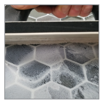
With a firm to medium sharp-edged rubber float, force grout diagonally into the joint at a 45° angle, ensuring that the grout is wellcompacted, free of voids and pin holes, and filled flush with the tile or stone edge.