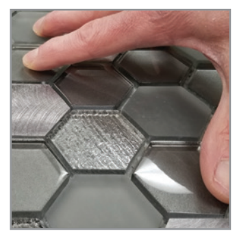
Place tiles firmly with a slight back and forth motion across ridges and tamp tiles repeatedly to achieve at least 90% adhesive contact with the tile back.