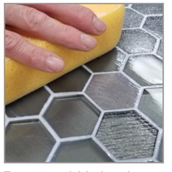
Then, using a slightly damped sponge (not wet), gently wipe excess material from the surface using light and delicate diagonal passes. Change water and rinse the sponge frequently. Keeping the water and sponge clean will achieve better joint color uniformity.