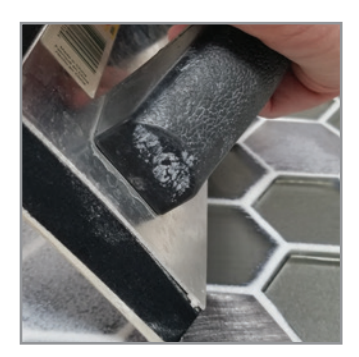
Remove excess grout through successive diagonal passes using the edge of the rubber float held at a sharp 90° angle.