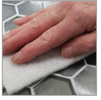
Allow grout to harden for about 20 to 30 minutes. Using a slightly damped white scrubbing pad, loosen up all excess grout over the tile with a circular motion. Do not add water before everything is well loosened up.